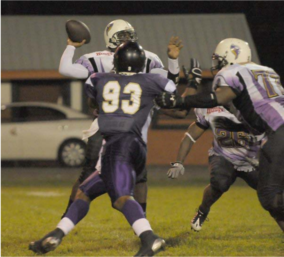
A WITHERING NASHVILLE STORM PASS RUSH SACKED TORNADO QBS 8 TIMES IN THE GAME